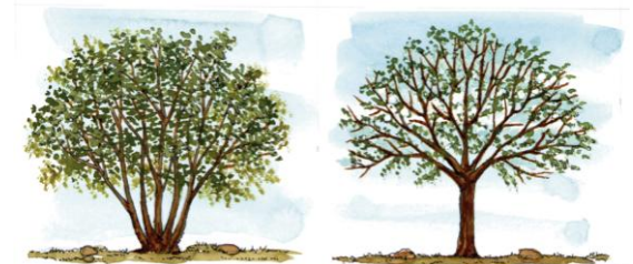
Good fodder tree