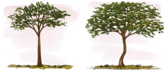
Good timber tree