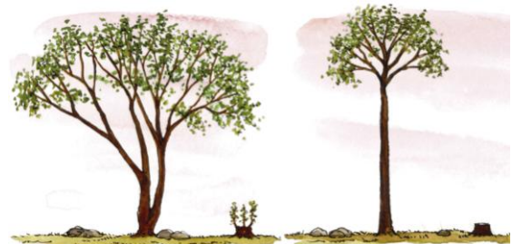
Good firewood tree